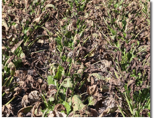
Sugarbeet with severe Cercospora leaf spot infection

sucrose, reduces the amount of extractable sucrose, and increases impurities escalating processing costs.